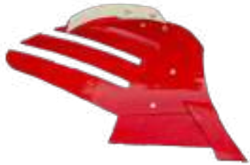
Slatted mouldboards for sticky conditions-Trashboards to improve burial of trash