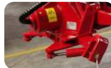
Oscillating shaft with shock absorption