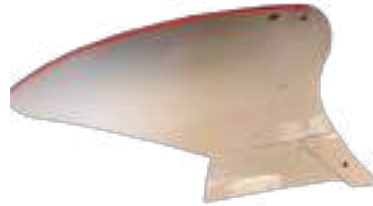
EcoFlow shares. Available in short or long versions. Advised for sticky soils to improve flow