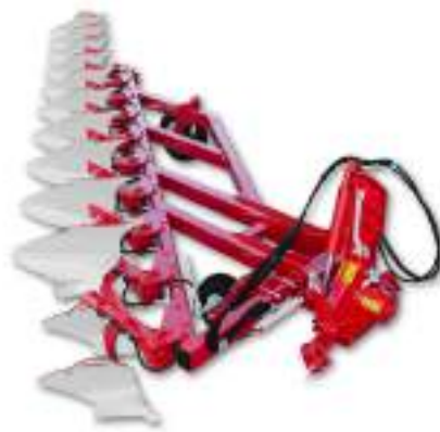
Mounted reversible Mini from 5 to 11 bodies: Mini-NF/NH