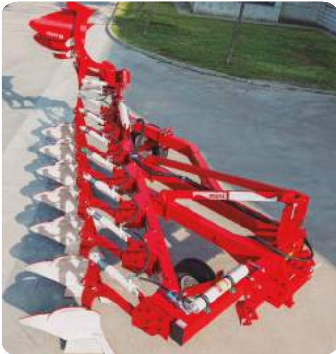
Mini HF 8+2

Just like the reversible Mini range, the conventional one covers three frame sizes: 6, 8 and 10 bodies. Each of these frames can be extended with the addition of one or two extra bodies, which can just be bolted on to the main frame, or hydraulically foldable, so as to reduce the total plough length and weight while road transport.