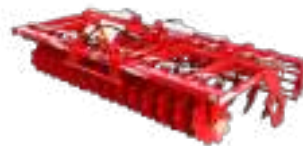
Short disc harrows