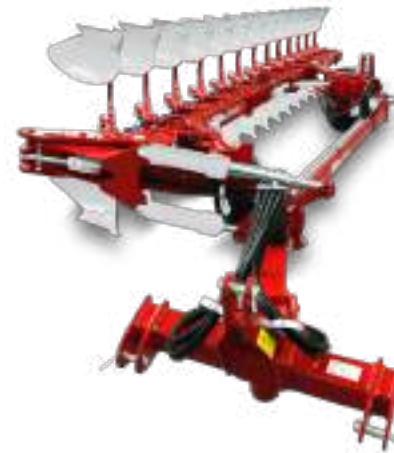
Semi-mounted Mini. Available in 12 and 13 bodies: Mini-SF/SH