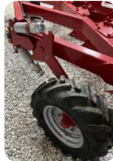
Hydraulic depth control or combi wheel for transport and depth control