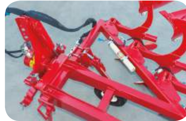
Headstock and frame support