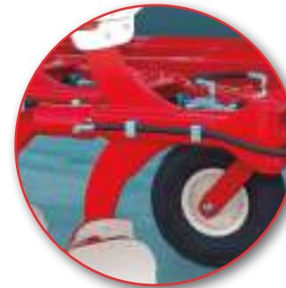
Hydraulic auto-reset system: Mini-HF, Mini-NH, Mini-SH