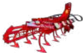
Tine cultivators for vineyards