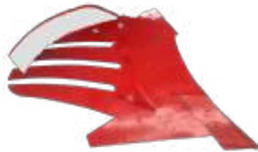
Extra large forged share. 12 cm longer than standard share