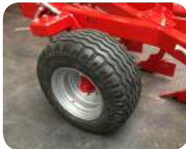
Transport wheel available as 200/60 14,5", 250/65 14,5", 340/55 16" and 380/55 17"