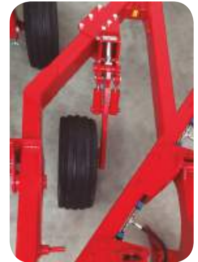
Inner depth control wheel (available for Mini-N 7 and 9 frames)