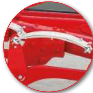
Leafspring security system: Mini-BF