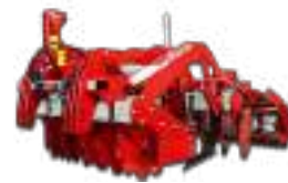
Short disc harrows for vineyards