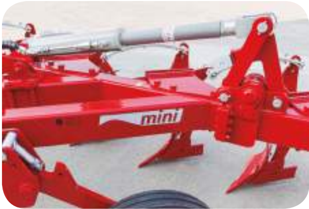
Optional hydraulic folding of rear bodies in order to reduce weight during transport or, when necessary, to work with fewer bodies