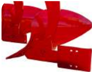
Landslide extension, for better plough stability