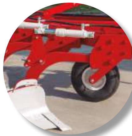
Mini HF body