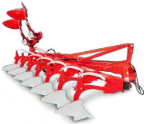
Conventional Mini from 6 to 12 bodies: Mini-BF/HF