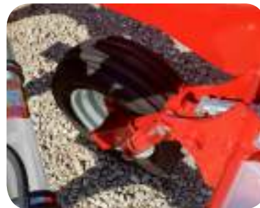
Front depth control wheel available as 6.00*9", 200/60 14,5" and 250/65 14,5"