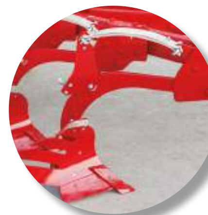
Mini BF body