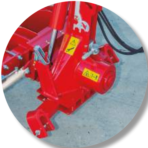
Oscillating cross shaft

In addition to the operational benefits the Oscillating Cross Shaft significantly reduces strain on the whole plough and fuel usage.