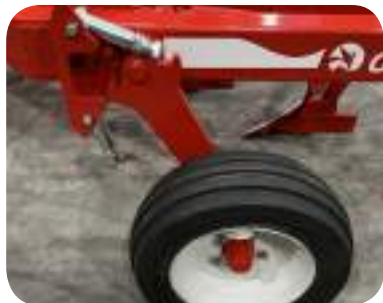
Depth control wheel. Available as 6.00*9", 200/60, 250/65, 340/55, 280/70 y 380/55