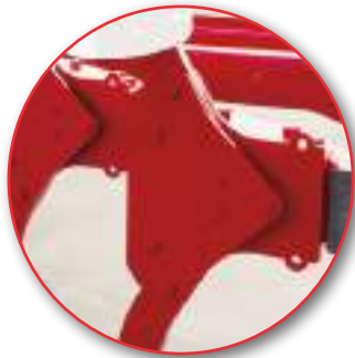
Shear-bolt security system: Mini-NF, Mini-SF