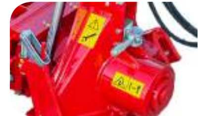
Headstock lock for transport