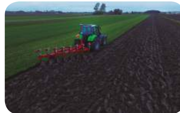
MINI NF 7+1 HOLLAND