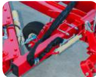
1st furrow hydraulic width adjustment