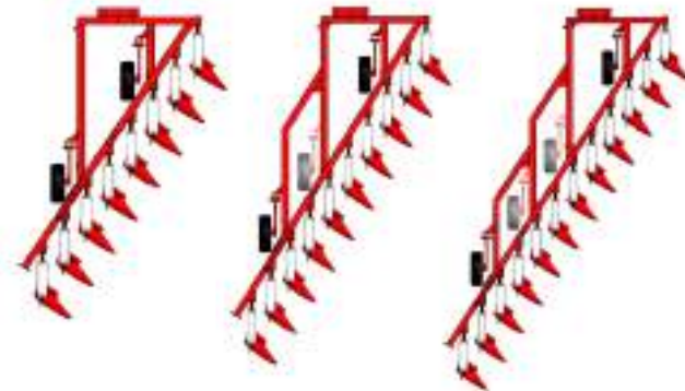
Plan view of Mini-6, Mini-8 and Mini-10 ploughs. In shaded colour, position of optional bolted-on rear wheel in contrast with the standard rear wheel.

Just like the reversible Mini range, the conventional one covers three frame sizes: 6, 8 and 10 bodies. Each of these frames can be extended with the addition of one or two extra bodies, which can just be bolted on to the main frame, or hydraulically foldable, so as to reduce the total plough length and weight while road transport.