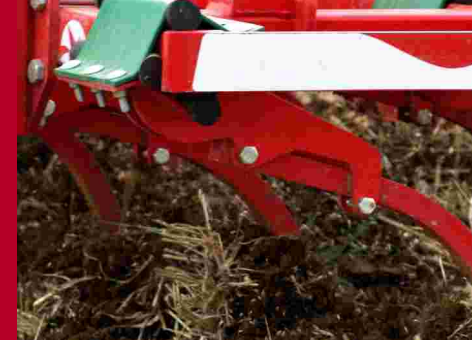
Rubber suspension 100% maintenance-free