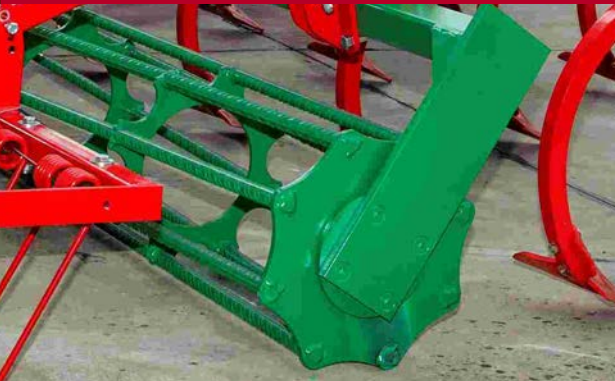
400 mm CRG roller