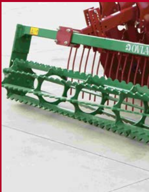
400 mm Notched roller