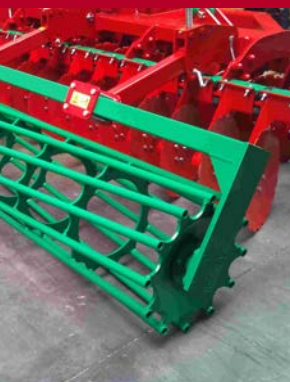
450 or 540 mm Cage roller