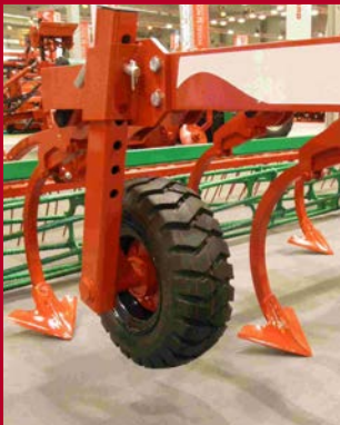
Side depth control wheels