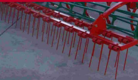
Rear tine harrow