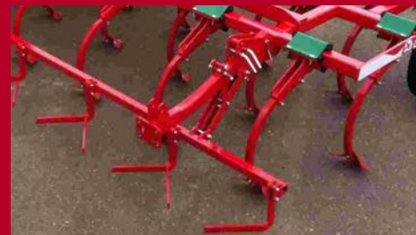
Levelling harrow (only for 3 row Minichisel )