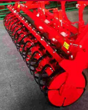
520 mm Leafspring roller